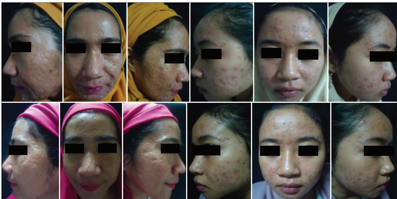
Figure 2: Clinical improvement after 28 days of the autologous serum and doxycycline group

In this study, menstrual estradiol levels (follicular phase) were obtained in levels ranging from 20.8 to 200.5 pg/mL. The concentration of estradiol levels is lowest during the menstrual phase with serum concentrations around 40–200 pg/mL. Meanwhile, the level of estradiol during preovulation was around 250–500 pg/mL, so it was concluded that the estrogen levels in the menstrual phase were lower than that of the preovulatory phase. Low estrogen levels are associated with the severity of acne. Androgen hormones increase the production of sebum, so that the sebum levels in patients with acne vulgaris are higher than in normal people [10]. There is a relationship between sebum excretion and the severity of acne vulgaris because the sebum levels in patients with severe acne vulgaris are found to be higher in levels. Estradiol can inhibit sebum production to reduce sebum levels. The use of